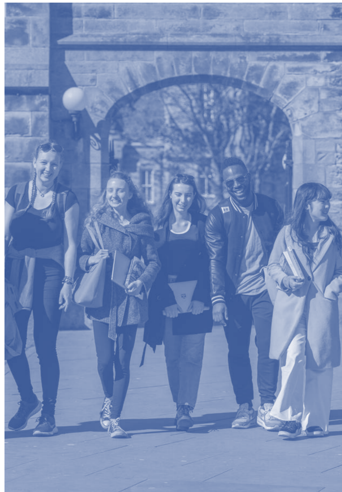
Spring sunshine in St Salvator's Quad

Gifts were also received from three anonymous donors