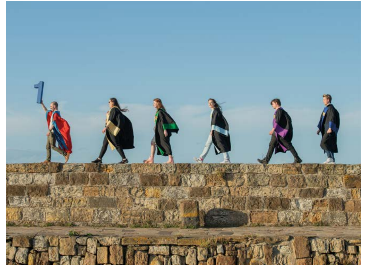
Celebrating our historic double first

Thank you to each and every one of you – we couldn't do any of this without you.