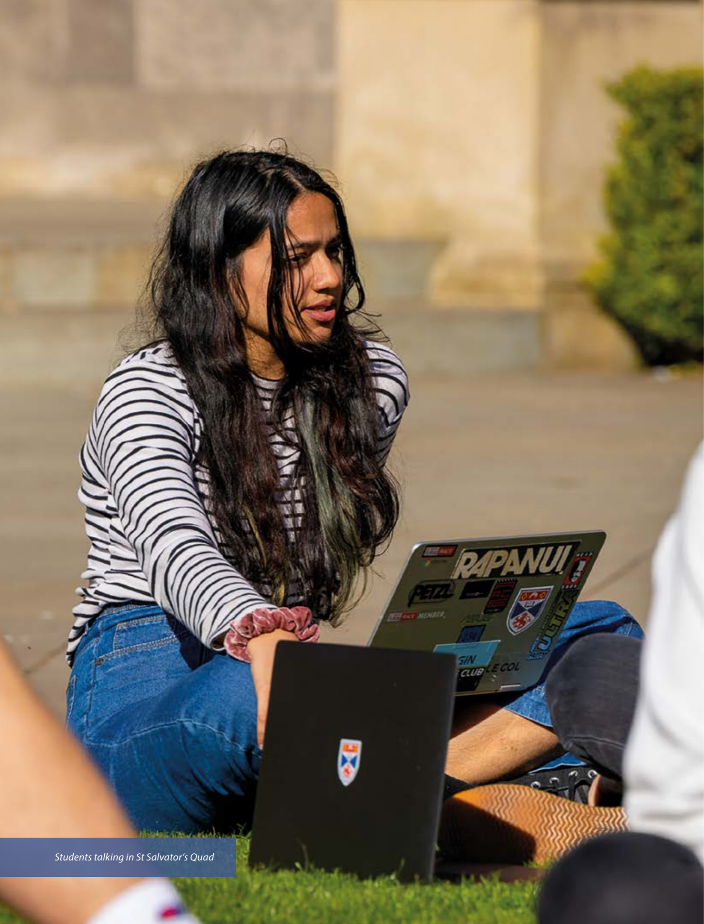
Students talking in St Salvator's Quad